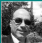
P. Marc LaFrance

Minister of Ministry of Public Works and Public Housing, Republic of Indonesia