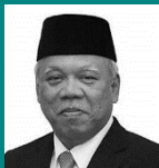
Basuki Hadimoeljono, Ph.D

Minister of Ministry of Public Works and Public Housing, Republic of Indonesia